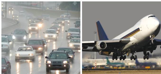
Suitable for a range of applications.

In aviation there is a trend towards increasing both safety and capacity at aerodromes which can require the installation of visibility and present sensors on runways and increasingly along taxi ways. The SWS-250 meets or exceeds all international aviation specifications for visibility measurement and present weather reporting whilst offering an affordable solution for both acquisition and cost of ownership.