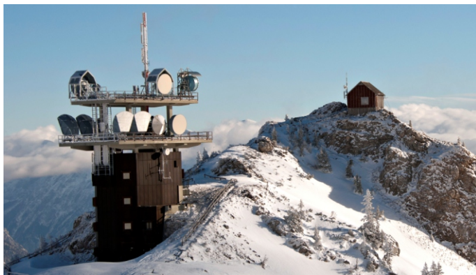
The SWS-250 is ideally suited to provide accurate measurement of raw data for forecasting models.

Whilst the models used for forecasting continue to improve there remains a need for accurate measurement of current weather conditions to provide the model's input. Improvements to forecast accuracy can also be gained by increasing the number of monitoring sites but there is always a trade-off between forecast quality and cost. The SWS-250 is ideally suited to this type of application due to the accuracy of measurement, the wide range of present weather conditions reported and the cost effective design.