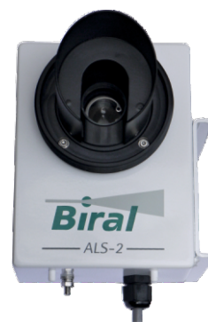
Biral's ALS-2 Ambient Light Sensor

The SWS sensor family is designed for easy installation by a single person and has an interface which simplifies system integration. The ASCII text data message is transmitted at user defined time periods or in response to a polled request. The standard data message provides MOR and EXCO along with present weather codes according to both WMO Table 4680 and METAR standards. An optional interface to the ALS-2 Ambient Light Sensor simplifies use in aviation applications where both METAR and RVR information is required. The ALS-2 Ambient Light Sensor data is appended to the standard sensor data message simplifying both installation and data processing.